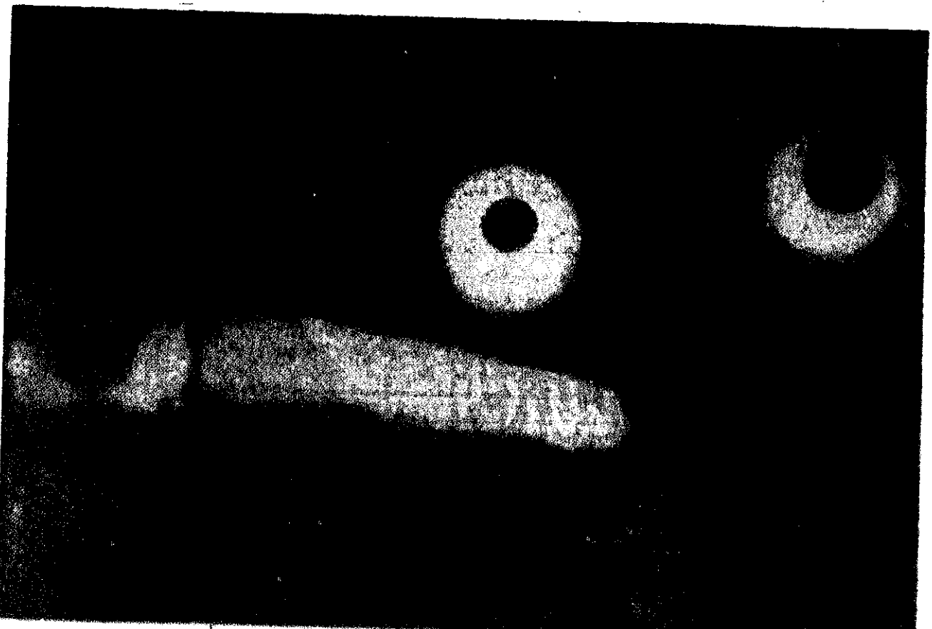
STRANGE OBJECT —Reports of pictures of strange objects sighted all over the nation were common last week Saturday. Forum photographer All T. Olsen saw and photographed a cigar-shaped object which he said hovered in view

for several minutes about noon. He was able to make three shots, shooting at 116 and twenty-fifth of a second. The first two are shown here. The third is on the next page.